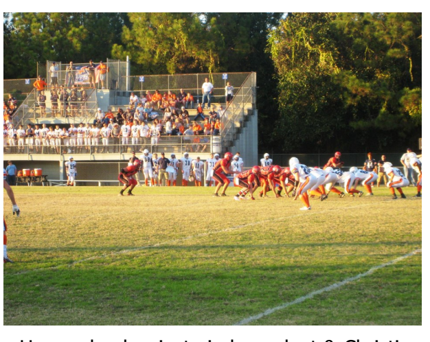
Homeschool, private independent & Christian school teams will compete in the 2017 NHSA National Football Tournament (11-man Independent

Thursday, Nov 9th, 2017 thru Sunday, Nov 12th, 2017