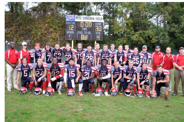
2017 NHSA Champions OKC Patriots

Thursday, Nov 8th, 2018 thru Sunday, Nov 11th, 2018